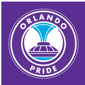
PRIMARY LOGO DARK BG