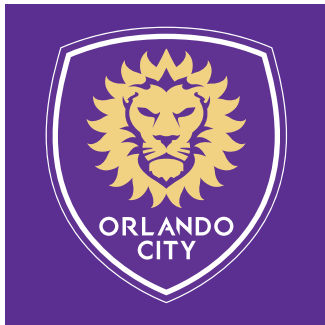
PRIMARY LOGO DARK BG